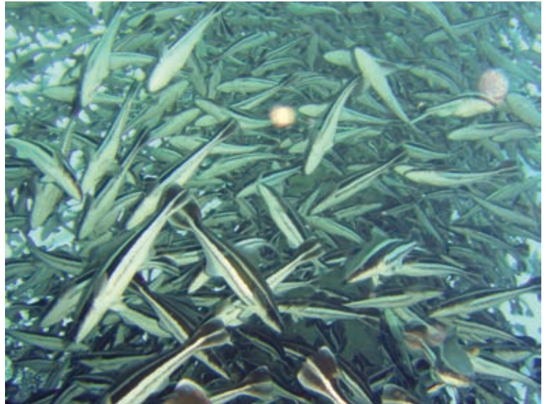
Juvenile cobia swimming inside a SeaStation 3000 cage belonging to AquaSense Bahamas Ltd. in South Eleuthera, the Bahamas. The demonstration project was run by the Cape Eleuthera Institute in collaboration with RSMAS/University of Miami.

No coral reefs are present in the area near the cages. Rather, sparse patches of Halimeda sp., a macroalgae characteristic of an oligotrophic environment, are found at the predominantly sandy bottom. In the near future, to utilize the inorganic nutrients being released by the systems, rafts and longlines of filter feeder molluscs (scallops and oysters) and macroalgae will be deployed in the area surrounding the cages. The submergible cages provide ideal habitats and are also acting as fish aggregating devices, attracting a wide variety of transient and resident species of vertebrates and invertebrates. These organisms thrive on any feed pellets that