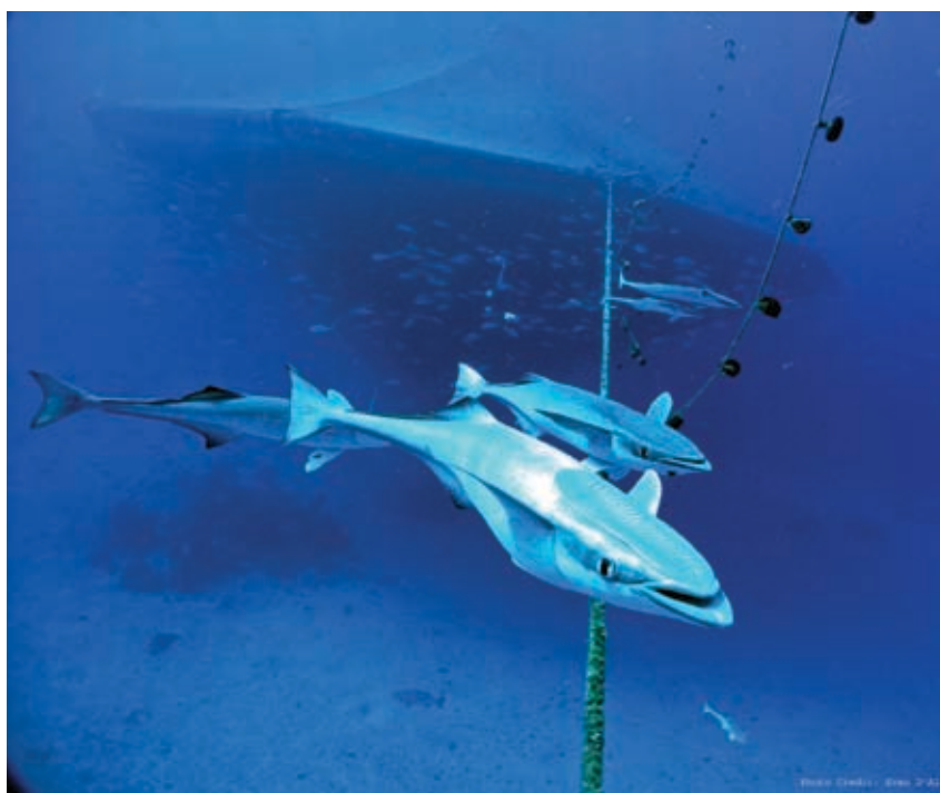
A remora swims around a SeaStation 3000 stocked with cobia in South Eleuthera, the Bahamas. The cage (background) is tilted due to strong currents prevailing in the area.

The offshore aquaculture demonstration projects currently being conducted in Culebra Island, Puerto Rico and South Eleuthera, Bahamas, are completely submerged, thereby preserving the aesthetic appearance of the areas. Systems clear at least 12m from the surface in order to avoid impediments to navigation. The depth of the site (25-30m)