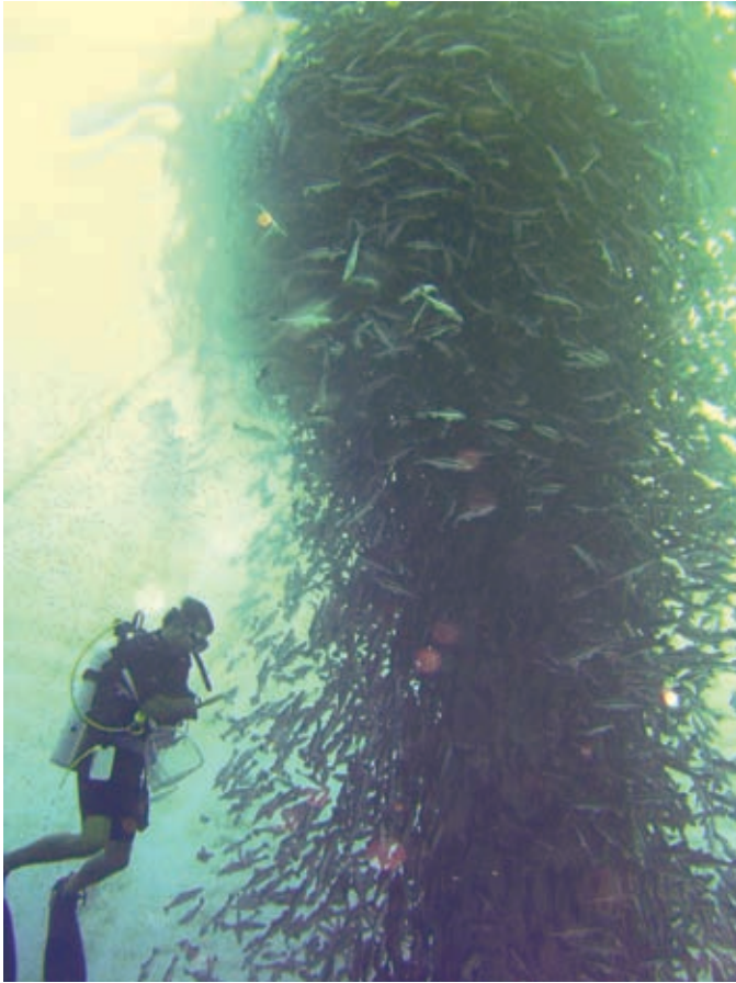
Sampling juvenile cobia in the Bahamas.

in the surrounding areas. Because, after conducting studies for three years, we could not measure or detect any harmful effects, our focus and attention have shifted to predator control and the economic viability of the operations. Particularly in the Bahamas, there have been episodes of sharks attacking dead fish and damaging the nets at the bottom of the cage. As a consequence, there have been fish escapements and production losses, compromising the economic viability of the operation. In addition, and also importantly, fish escapements from net cages could arguably be detrimental to the environment. Even though these fish are native, endemic to the region and healthy, many researchers believe that such escapements could compromise the genetic makeup of the local population of the species.