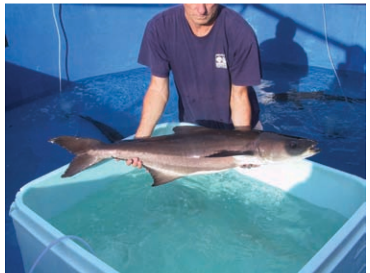
Anesthetized cobia ( Rachycedntron canadum ) broodstock undergoing prophylaxis.