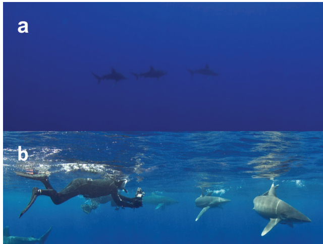
Fig. 2. — Nose-to-tail following behavior in free-ranging oceanic whitetip female sharks at a distance of (a) ~ 150 m away from the photographer on the April 2013 expedition, and (b) in close proximity to divers during a 2012 expedition.